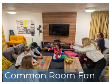
Common Room Fun