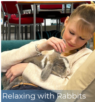
Relaxing with Rabbits