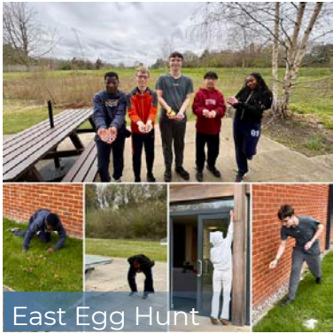
East Egg Hunt