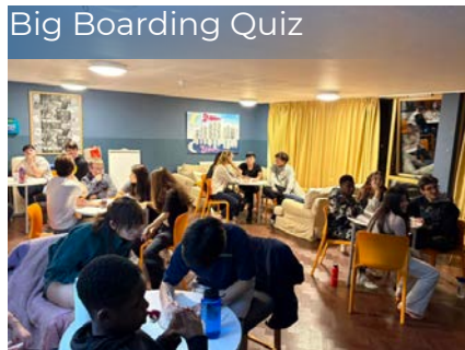
Big Boarding Quiz